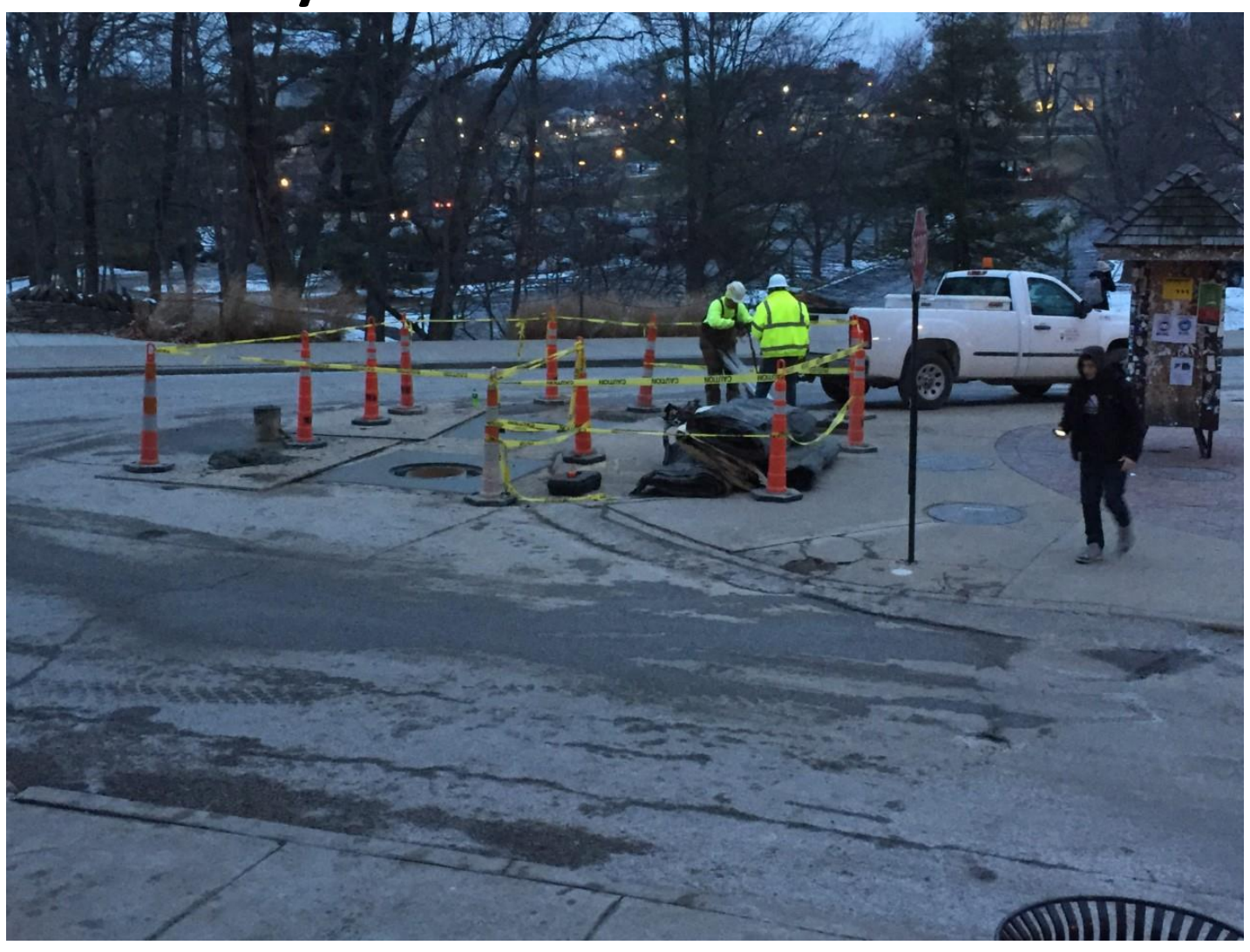
What is wrong with this picture.....and how can we fix it?